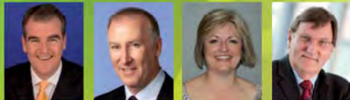
The Hon. Michael Daley