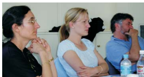
Above: AIPN Executive Strategic Planning Meeting in Sydney.